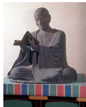
Statue of Taira-no-Kiyomori

This room is dedicated to artifacts related to Itsukushima Shrine and Taira-no-Kiyomori. Such materials as images and a chronology outlining the footsteps of Taira-no-Kiyomori and the present-day Itsukushima Shrine inscribed on the World Cultural Heritage List are exhibited in six zones.