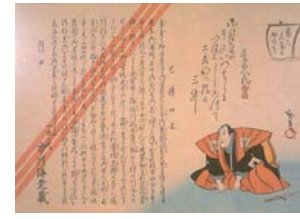
Picture depicting a Kabuki Actor