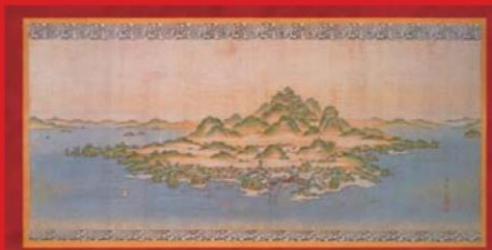
Landscape of Itsukushima Island by Kobayashi Geppo