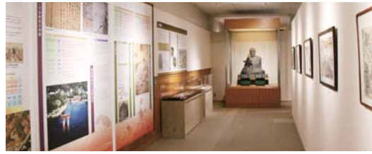
Exhibit Room D (First Floor)

This room is dedicated to artifacts related to Itsukushima Shrine and Taira-no-Kiyomori. Such materials as images and a chronology outlining the footsteps of Taira-no-Kiyomori and the present-day Itsukushima Shrine inscribed on the World Cultural Heritage List are exhibited in six zones.