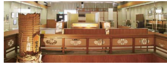
Exhibit Room D (Second Floor)

Numbering 400 in all, historical items such as paintings, folding screens, old pictorial maps, old photographs, guidebooks and ancient documents on Miyajima and earthenware dating as far back as the Edo period (1603-1867) are displayed. Pictures depicting sightseeing spots of the Edo period and other materials related to theatrical plays and lotteries conducted in Miyajima are essential to understand Miyajima Island, an island of worship and sightseeing.