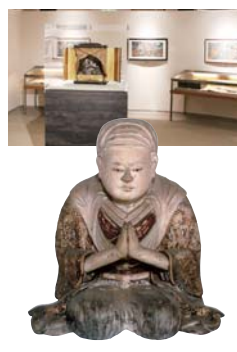
Statue of Nii-no-Ama (Wife of Kiyomori)