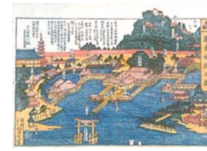
Picture depicting Itsukushima Shrine