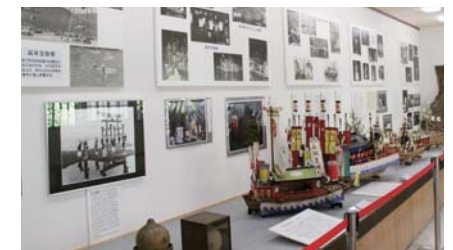
Exhibit Room B

The major industry on Miyajima Island has been woodwork. Woodcrafts, such as the rice scoops conceived by the Buddhist Monk Seishin, trays and sweet bowls made with a lathe, wooden spoons and Miyajima-bori carvings, were developed late in the Edo period (1603-1867). About 100 items, including models used in the production process, tools and products, and signboards of wholesalers, showing the development of the industry to this date, are exhibited.