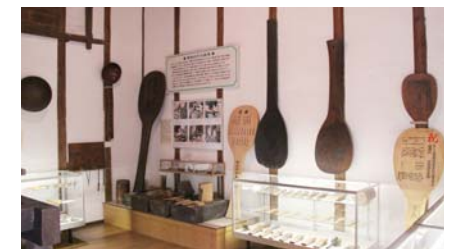
Exhibit Room C

The major industry on Miyajima Island has been woodwork. Woodcrafts, such as the rice scoops conceived by the Buddhist Monk Seishin, trays and sweet bowls made with a lathe, wooden spoons and Miyajima-bori carvings, were developed late in the Edo period (1603-1867). About 100 items, including models used in the production process, tools and products, and signboards of wholesalers, showing the development of the industry to this date, are exhibited.