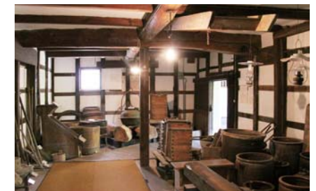
Exhibit Room A

Miyajima has a variety of traditional events, including Toka-sai (Jin-noh), Kangen-sai, Tamatori-sai, Tanomo-san, Ujigami-sai and Chinka-sai. In this room, about 70 items, including photographic panels and related materials and models, introduce these annual events. It also exhibits a miniature model of the main boat with a sacred palanquin and escort boats for the Kangen-sai Festival.