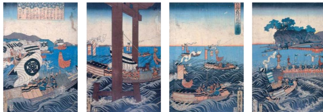
Battle of Itsukushima by Utagawa Sadahide

57 Miyajima-cho Hatsukaichi-shi Hiroshima-ken TEL 0829-44-2019 FAX 0829-44-0631